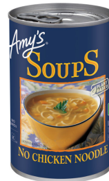
Amy's Soup selected varieties