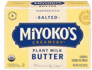
Miyoko's Creamery Organic Vegan Butter