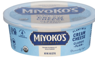
Miyoko's Creamery Organic Vegan Cream Cheese selected varieties

For plant-curious foodies seeking delicious and kinder food choices, Miyoko's Creamery is an organic plant milk creamery that crafts the world's finest vegan cheese & butter, empowering them to choose good food that nurtures good in our world.