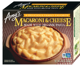
Amy's Macaroni & Cheese

At Amy's, we cook every meal with love. We spend countless hours in our kitchens, so you can enjoy delicious food in minutes. From our scratch made sauces to the perfectly balanced flavors, every bite delivers the comforting taste of home.