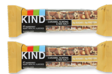
KIND Nut Bar selected varieties