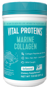
Vital Proteins Marine Collagen