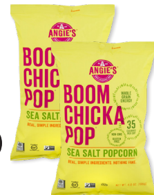
Angie's BoomChickaPop Popcorn selected varieties