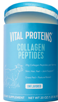
Vital Proteins Collagen Peptides selected varieties