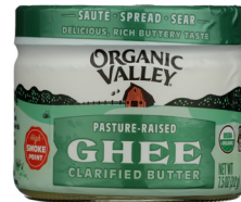
Organic Valley Organic Ghee selected varieties