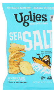
Uglies Kettle Chips Potato Chips selected varieties