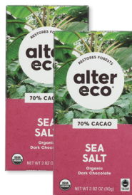
Alter Eco Organic Chocolate Bar selected varieties