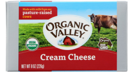
Organic Valley Organic Cream Cheese selected varieties