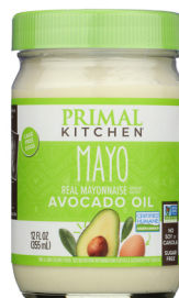
Primal Kitchen Mayo with Avocado Oil selected varieties