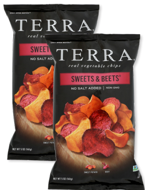
Terra Chips Vegetable Chips selected varieties