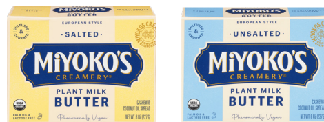
Miyoko's Kitchen Organic Plant Milk Butter

For plant-curious foodies seeking delicious and kinder food choices, Miyoko's Creamery is an organic plant milk creamery that crafts the world's finest vegan cheese & butter, empowering them to choose good food that nurtures good in our world.