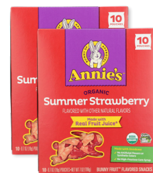
Annie's Organic Fruit Snacks selected varieties