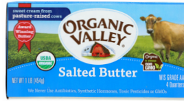
Organic Valley Organic Butter selected varieties

Bring some small family farm goodness to your spring baking with Organic Valley. All Organic Valley dairy products are made with organic milk from pasture-raised cows for undeniably delicious flavor.