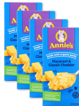
Annie's Mac & Cheese selected varieties